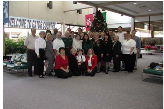
Members of the Hospitality Council